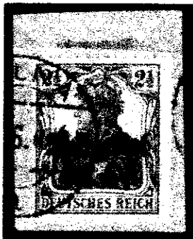
Lot 161 (125%) Russia Sc#N1 [formerly Lithuania Sc#1N1]

👉👉👉👉 BIDDING DEADLINE IS July 31, 2016 👈👈👈👈