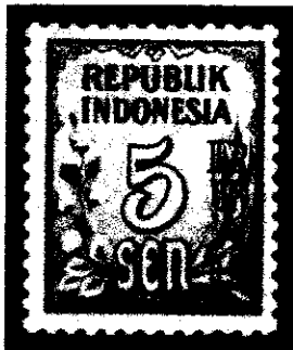
Lot 27 (150%) Indonesia - RIAU Sc#1

FICC gets 30% of the selling price for ALL stamps listed in this auction!!!!